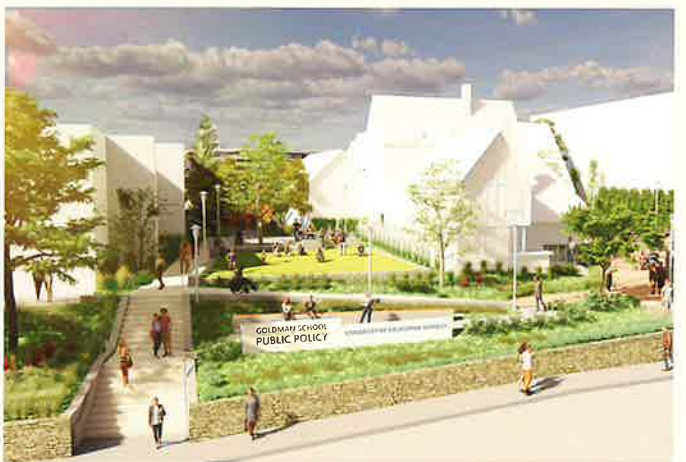
An artist's rendering of a possible remodel of the GSPP courtyard